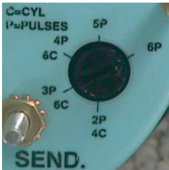
Rotary Switch type

On a Dip Switch type - Locate the selector dip switch behind a rubber plug. Note the position of the dip switches, only 1 switch will be in the ON position, the rest should be in the OFF position. With the power OFF cycle each switch about 10 times ON and OFF to clean the switch. When finished make sure the position of the dip switches matches the original settings.